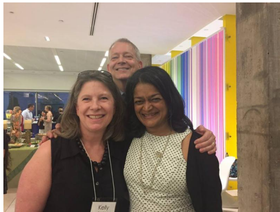
Rep. Pramila Jayapal, right

Our annual OCs OTC Working Group meeting took place on September 27, 2017 in Washington, DC. It was our largest, most interactive working group meeting ever with approximately 120 participants. Topics covered during the meeting included an overview of the working group's history, a presentation from our pharmaceutical partner, HRA Pharma, and sessions on state policy, Free the Pill, insurance coverage, and ensuring access for young people. Participants also had the opportunity to map opportunities and threats on the state, local, and/or constituency level.