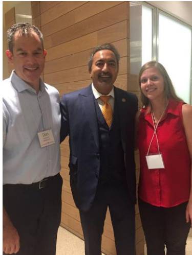
Rep. Ami Bera, center